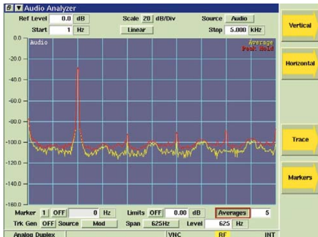
Figure 3.0: Audio frequency analysis showing 1 kHz tone with artifacts at 2 kHz, 3 kHz, 4 kHz and 5 kHz.

Audio measurements, too, can be disputed. If there is no high quality reference signal: measuring Audio distortion, it is impossible when the 1 kHz reference signal is already noisier than you would normally expect from your radio. See Figure 3.0 for audio generator quality analysis.